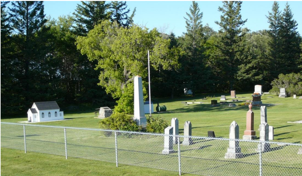
Viewed from the southwest - The "little church" was built after the church was moved to the village, and this one is a re-creation in 2009.

The cemetery includes a cenotaph listing the war dead, a cairn where the original church stood, a model replica of the church, a picnic table, and a toilet. Surrounded by evergreen trees, it is a sheltered and peaceful final resting place for Argyle's residents.